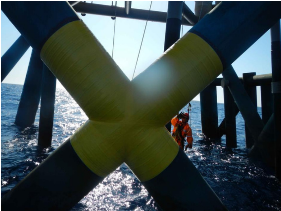
Application of the Intermediate Wrap PVC after the Wrappingband CZH application